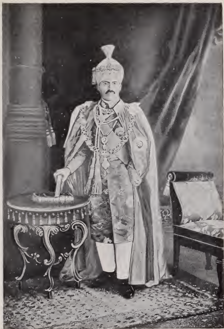
His Highness the Nizam of Hyderabad, G.C.S.I.